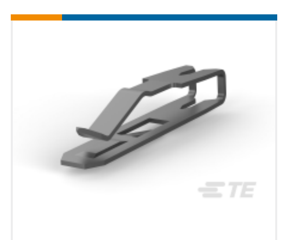
TE Part # 640631-3 MTA .156 CONTACT BRSNBR