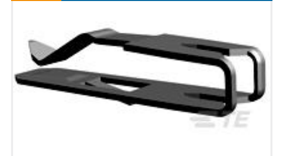
TE Part # 640635-3 MTA .156 CONTACT BRSNBR