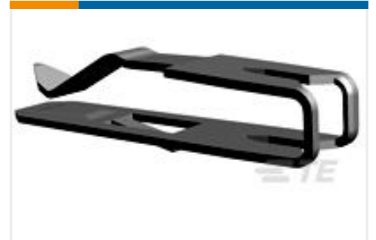
TE Part # 640634-3 MTA .156 CONTACT BRSNBR