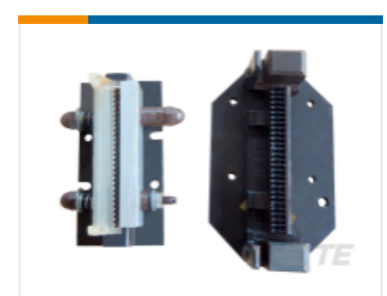
TE Part # 58040-1 MTA 156 ARBOR FIXTURE DISCRETE RBN CABLE