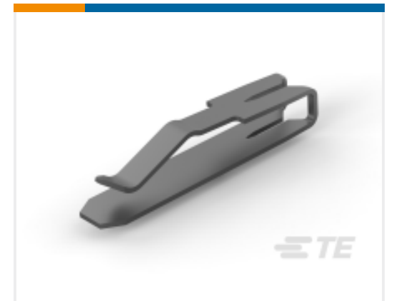
TE Part # 640633-3 MTA .156 CONTACT BRSNBR