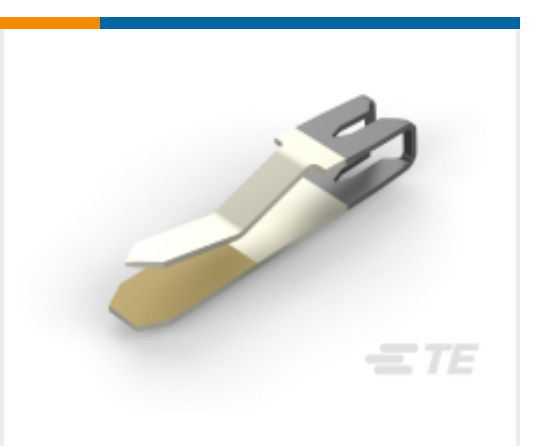
TE Part # 641143-3 MTA .156 CONTACT GPBR LP