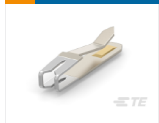
TE Part # 641144-3 MTA .156 CONTACT GPBR