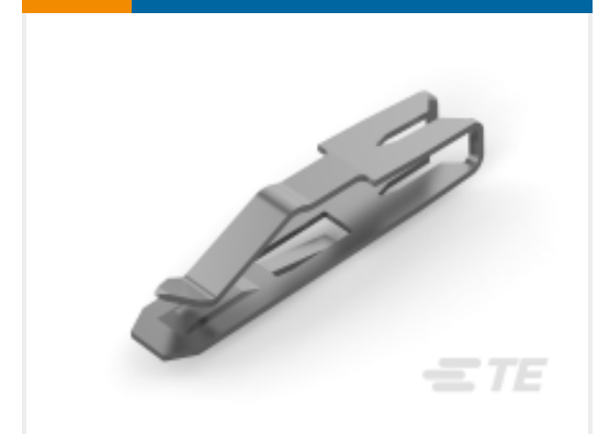
TE Part # 640632-3 MTA .156 CONTACT BRSNBR